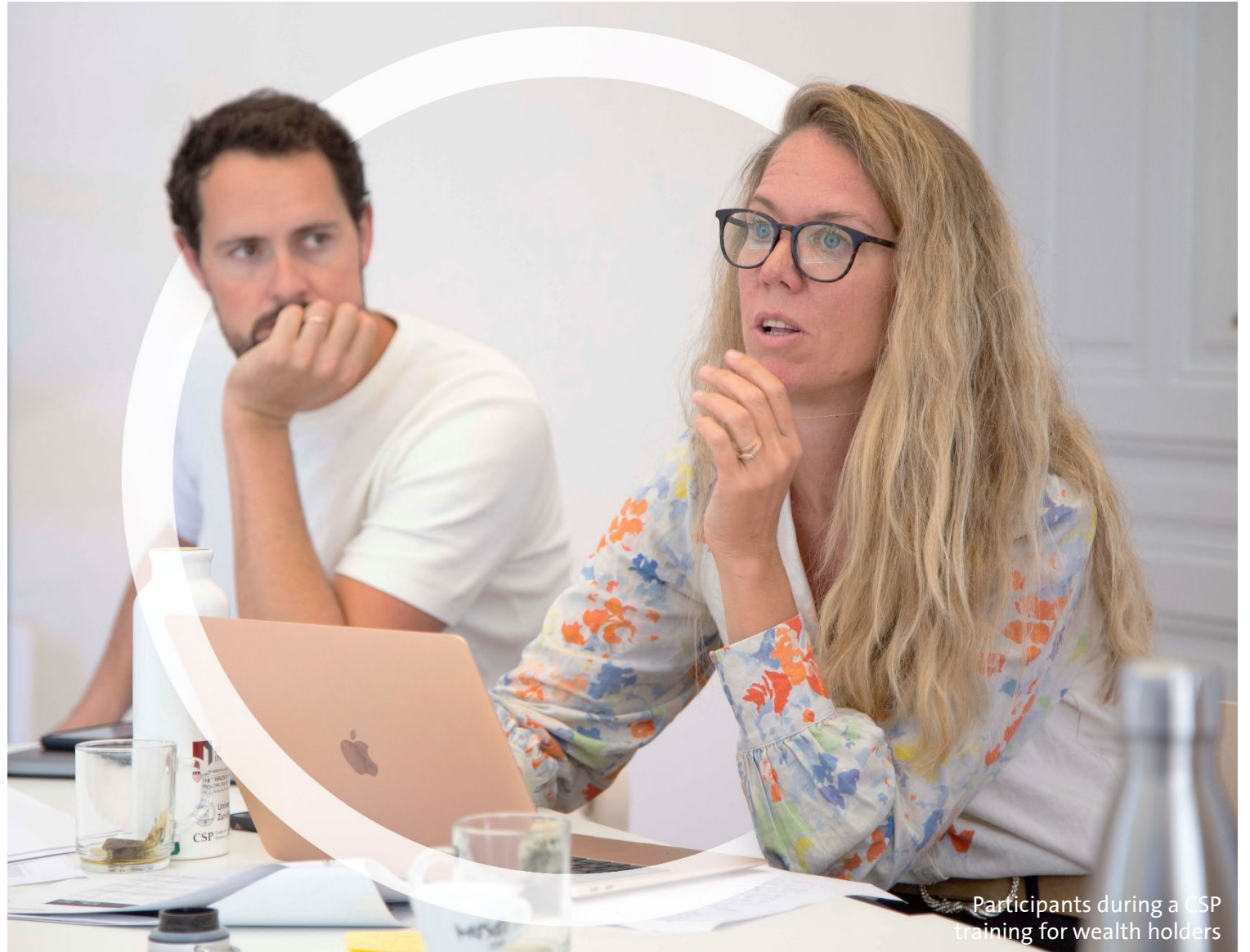
Participants during a CSP training for wealth holders

An overview of CSP's training programs for Wealth Holders and Wealth Managers