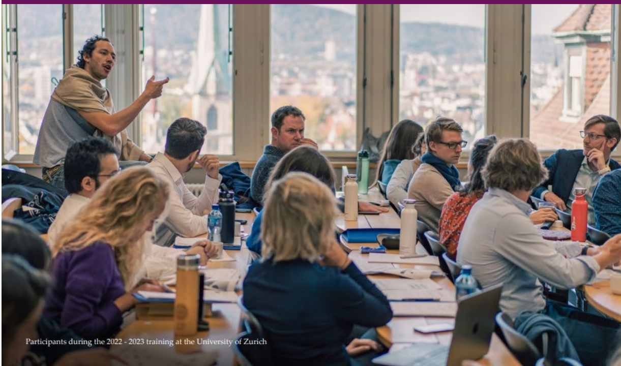
Participants during the 2022 - 2023 training at the University of Zurich